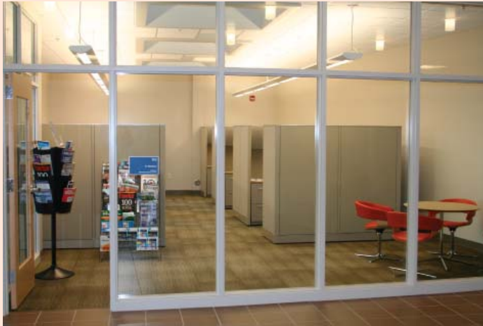
A modern business center in a team setting. Providing Continuous support and assistance.

The on-site Small Business Development Center will provide you with the tools and research you need to gain a competitive advantage