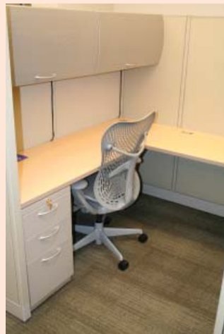
Enjoy Individual work space with secure storage areas for files and equipment then meet with clients privately in one of the conference rooms.

To be considered for either level contact the SBDC.